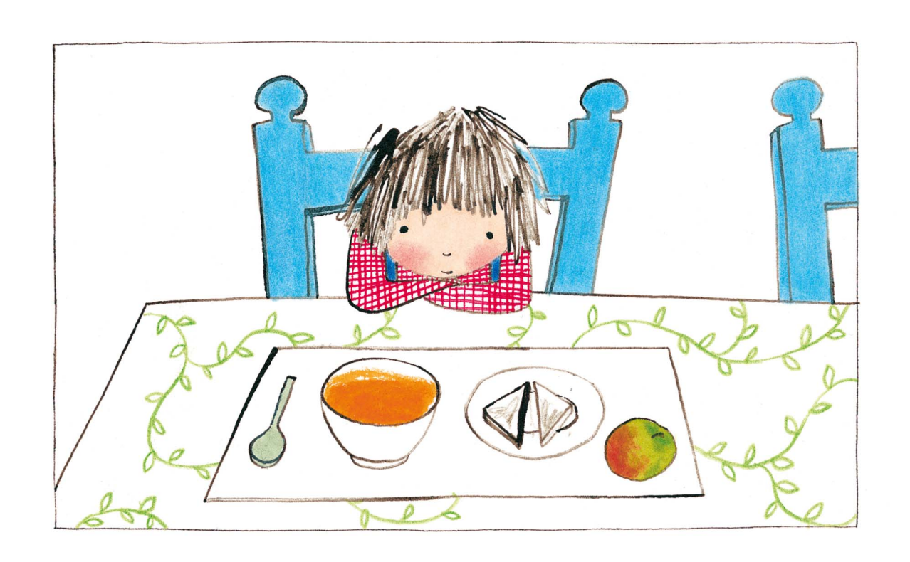
So I sat at the table.