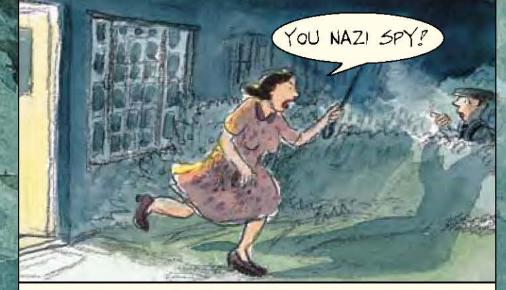
RUMOURS WENT ROUND. ONE NIGHT I SAW A MAN LURKING IN THE SHADOWS... MUM RAN OUT WITH A POKER BUT HE WAS JUST A LODGER STAYING NEXT DOOR!