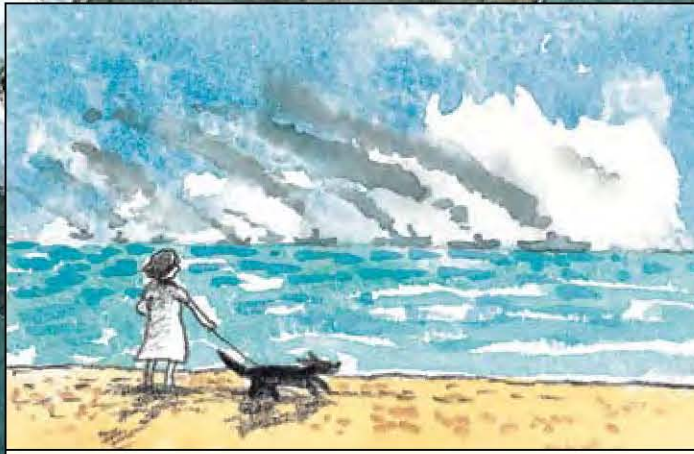
MANY CONVOY SHIPS CARRYING FOOD SUPPLIES FROM THE USA WERE TORPEDOED AND SUNK BY THE NAZI U-BOATS.