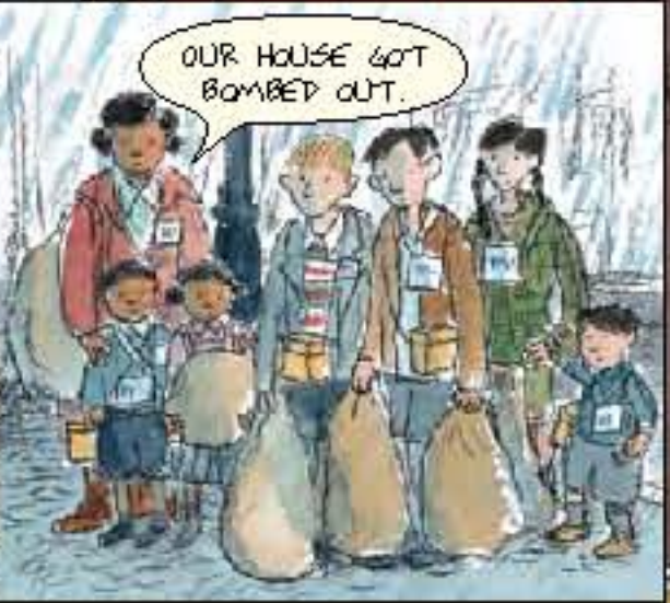
OUR HOUSE GOT BOMBED OUT.