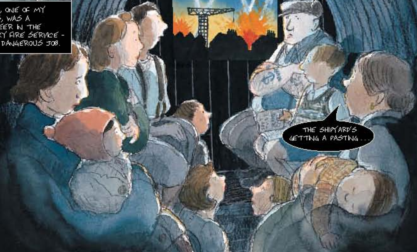
THE SHIPYARD'S GETTING A PASTING...