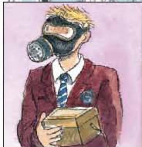
EARLY IN THE WAR, BECAUSE OF THE FEAR OF POISON GAS, EVERYONE CARRIED A GAS MASK - JUST IN CASE.