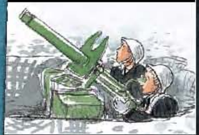
WOMEN VOLUNTEERS SOMETIMES OPERATED ANTI-AIRCRAFT GUNS ...

One weekend, visiting my cousins in Tyneside, I heard an eerie wailing noise. Air raid sirens! Searchlights lit up the sky. Enemy bombers droned overhead! We ran to the Anderson shelter in the garden. It smelled of tomcats; but as the bombs began exploding across the shipyards and the earth shook with every blast, it felt like the safest place in the world.