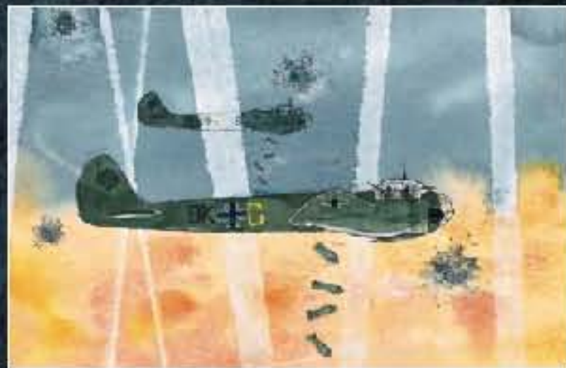
BRITISH CITIES, SHIPYARDS AND FACTORIES WERE HEAVILY BOMBED BY THE LUFTWAFFE IN 1940 - IT BECAME KNOWN AS 'THE BLITZ'.