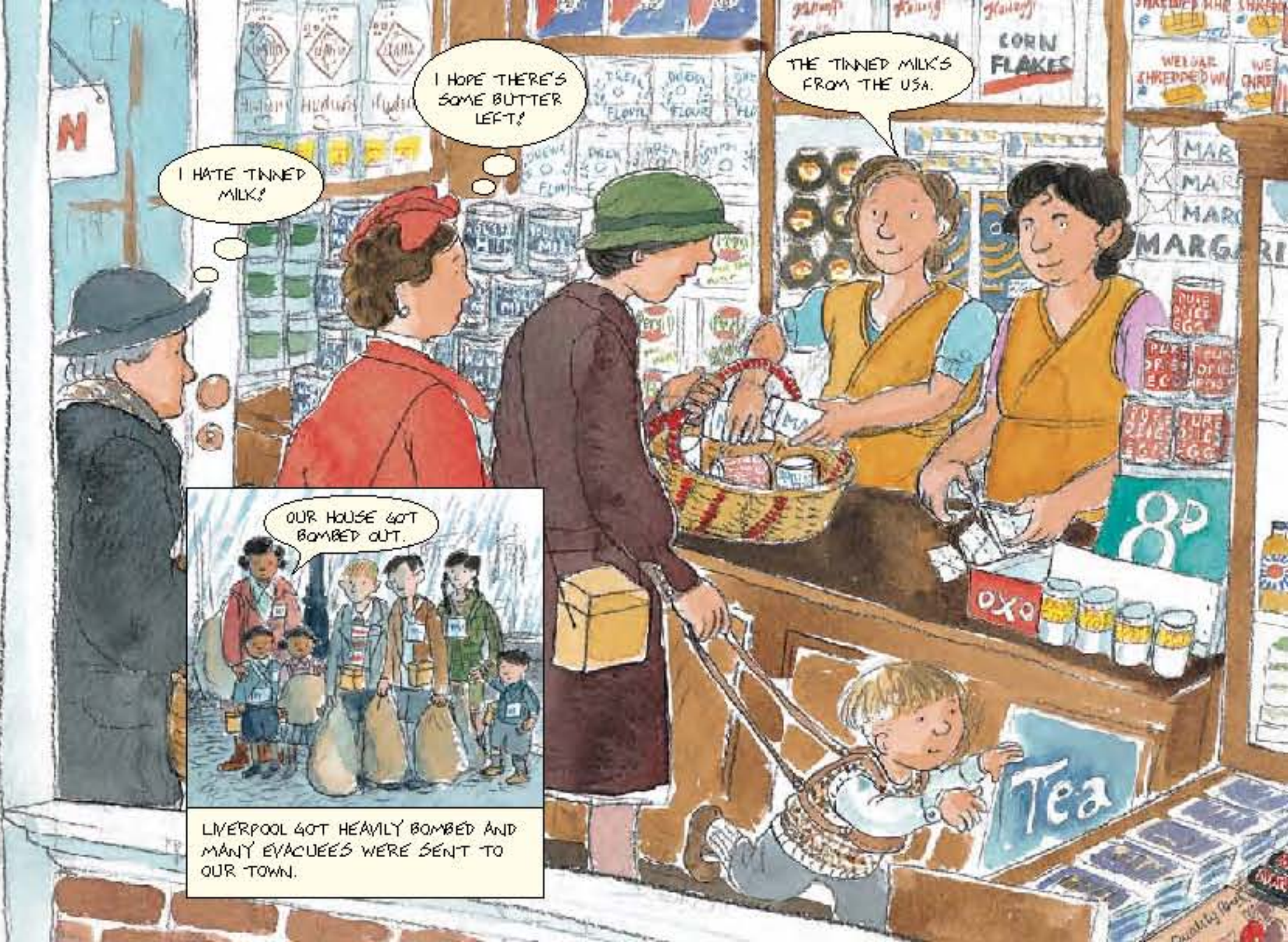
I HATE TINNED MILK!