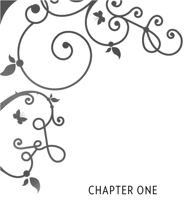
The Winter Court

The Iron King stood before me, magnificent in his beauty, silver hair whipping about like an unruly waterfall. His long black coat billowed behind him, accenting the pale, angular face and translucent skin, the blue-green veins glowing beneath the surface. Lightning flickered in the depths of his jet-black eyes, and the steel tentacles running the length of his spine and shoulders coiled around him like a cloak of wings, glinting in the light. Like an avenging angel, he floated toward me, hand outstretched, a sad, tender smile on his lips.