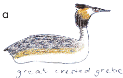
great crested grebe

cormorants, great-crested grebes and maybe a kingfisher; model boating; men's bathing, ladies' bathing etc. You are allowed to fish too (you need to get a licence from the park keeper near the tennis courts and café, and if you are over the age of twelve you need both a real licence and a park licence – see page 93 for details). Follow the path alongside the ponds.