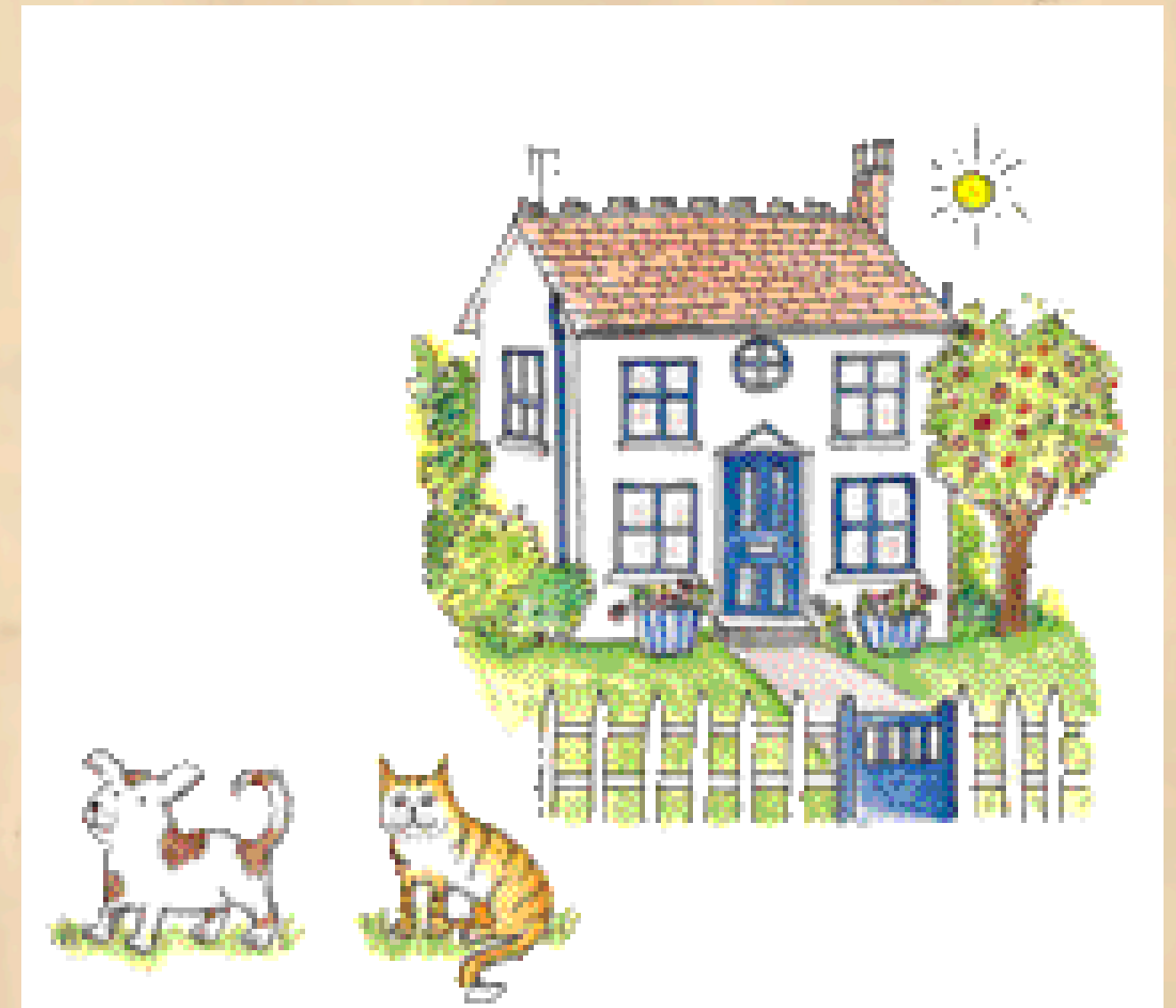
one dog and one cat.

But in real life, families come in all sorts of shapes and sizes.