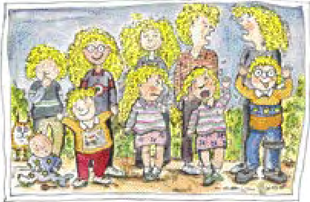
Some people have lots of brothers and sisters...