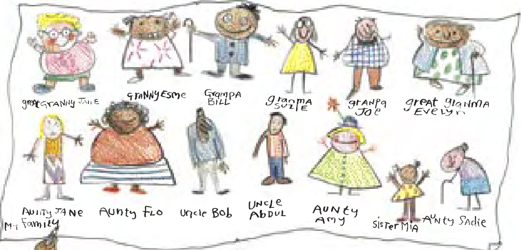
and uncles and aunts...