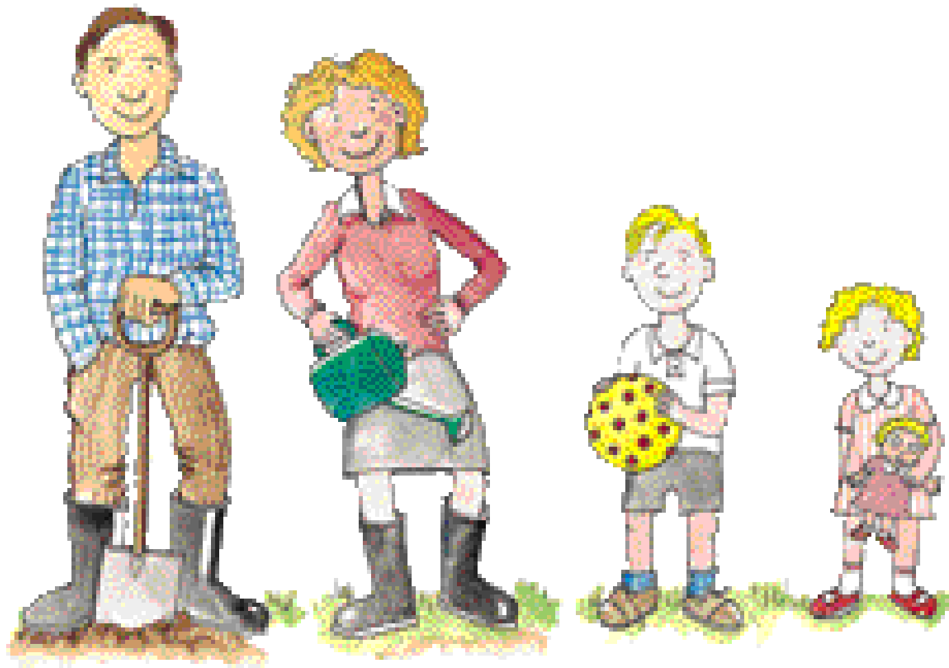
One daddy, one mummy, one little boy, one little girl,

Once upon a time most families in books looked like this –