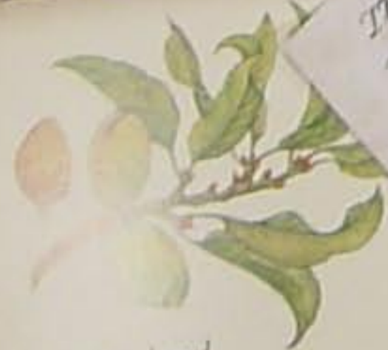
Sweet almond Prunus dulcis

I, the next 'Protector'? What nonsense is this? I know that Brooks had an interest in the darker side of myth and legend, but I now see that his belief in it went deeper than I ever thought. How I wish he was here to explain it to me, for I am finding it hard to believe that the book in front of me is fact rather than fiction. Yet it appears to have been written by my own friend, a man whose word I trusted above that of all others.