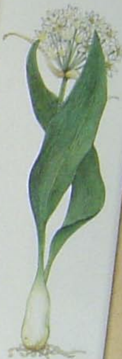
Wild garlic Allium ursinum

THE TEMPLAR COMPANY [Publishers of Rare & Unusual Books]