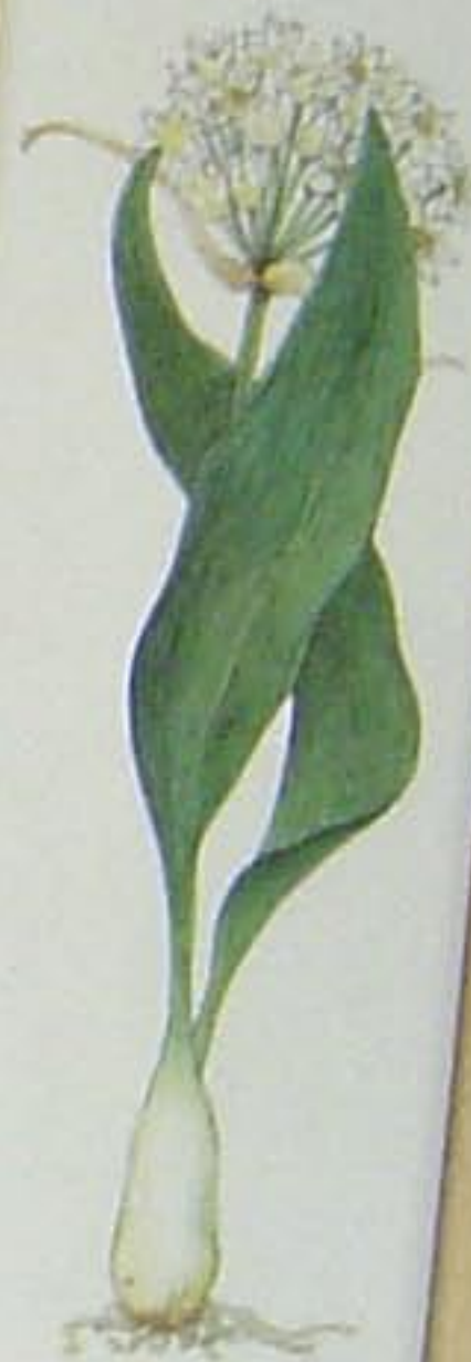
Wild garlic Allium ursinum