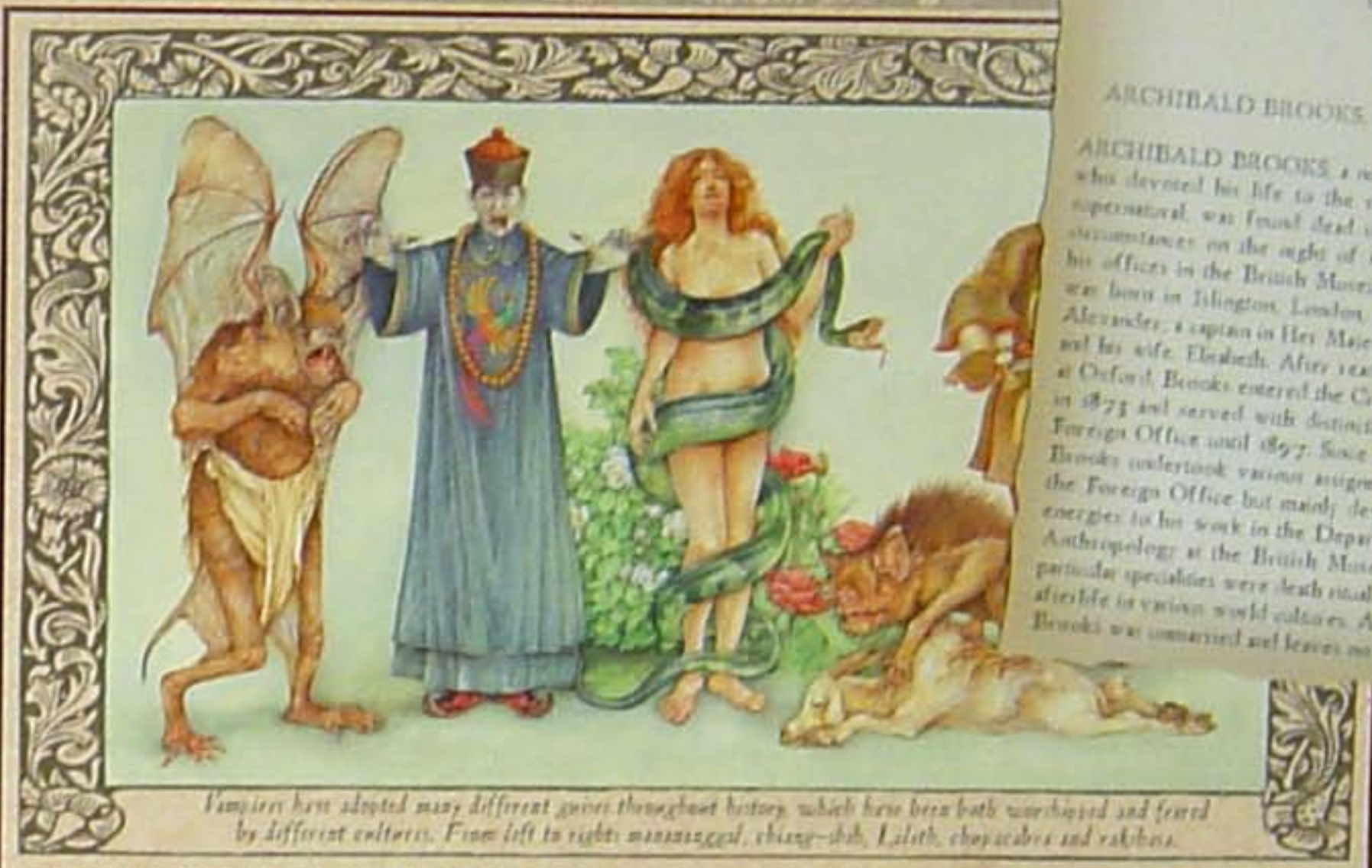
Vampires have adopted many different guises throughout history, which have been both worshipped and feared by different cultures. From left to right: manananggal, chiang-shih, Lilith, chayacabra and vampire.

ARCHIBALD BROOKS, a noted historian who devoted his life to the study of the supernatural, was found dead in suspicious circumstances on the night of 10th May at his offices in the British Museum. Brooks was born in Tilington, London, in 1870 to Alexander, a captain in Her Majesty's Navy, and his wife, Elizabeth. After reading history at Oxford, Brooks entered the Civil Service in 1893 and served with distinction in the Foreign Office until 1897. Since that time, Brooks undertook various assignments for the Foreign Office but mainly devoted his energies to his work in the Department of Anthropology at the British Museum. His particular specialties were death rituals and the afterlife in various world cultures. Archibald Brooks was unmarried and leaves no issue.