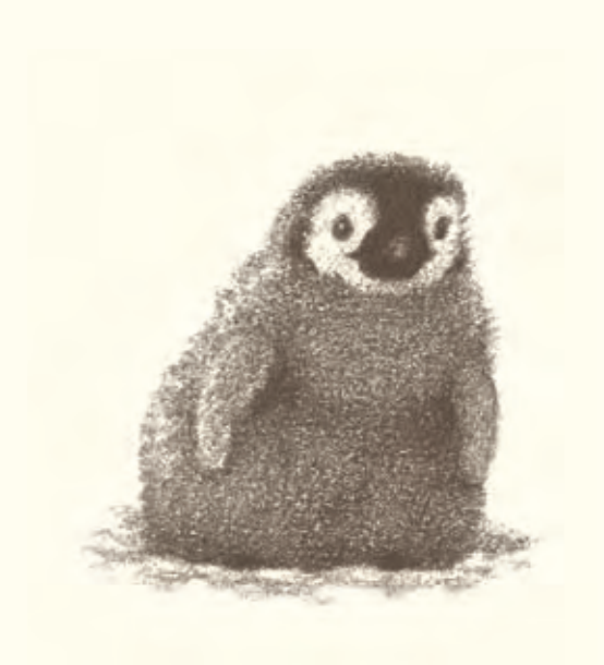
Otto was a penguin chick. He lived on his father's feet at the bottom of the world.