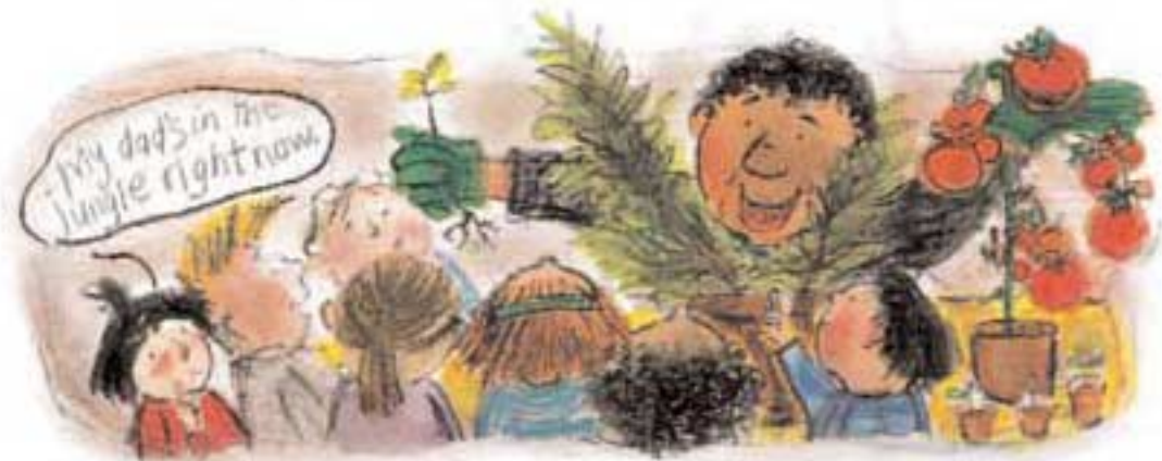
Leo's papa grows things.

At school, other children's dads come to visit Molly's class.