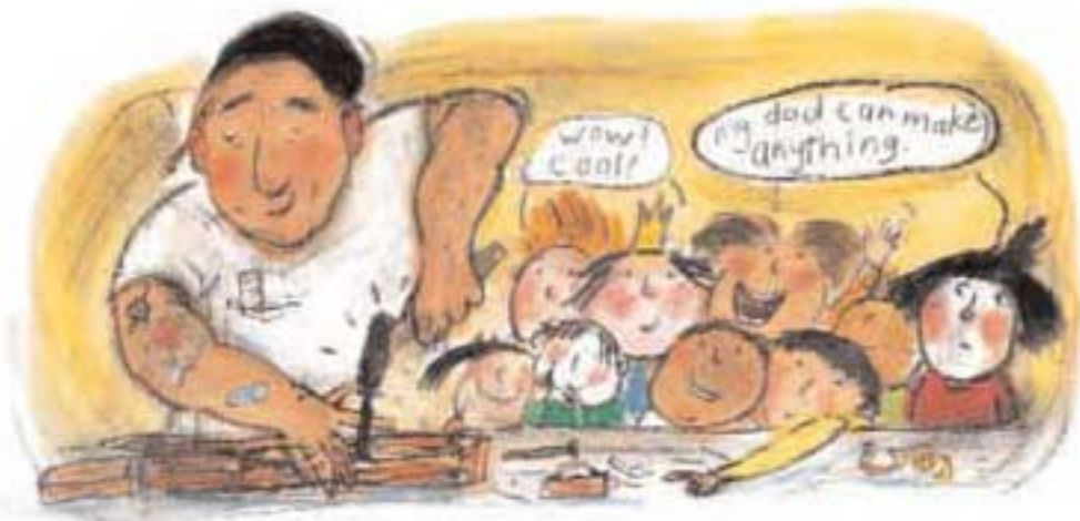
Woody's dad is a builder.