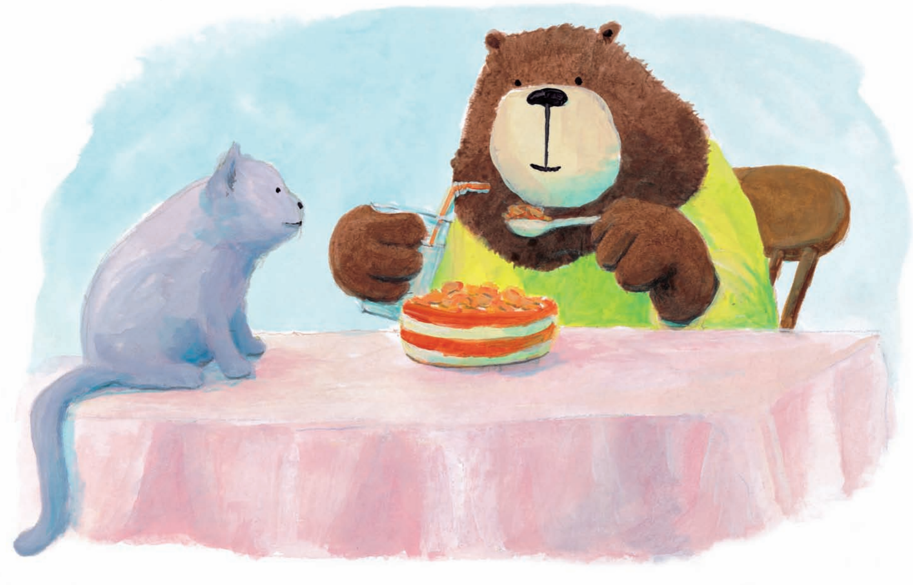
Matty was a trim, orderly bear who ate breakfast neatly at the kitchen table.

Once upon a time there were two bears who lived together, with Frampton the cat, in a cosy, pink house in the middle of a leafy forest.