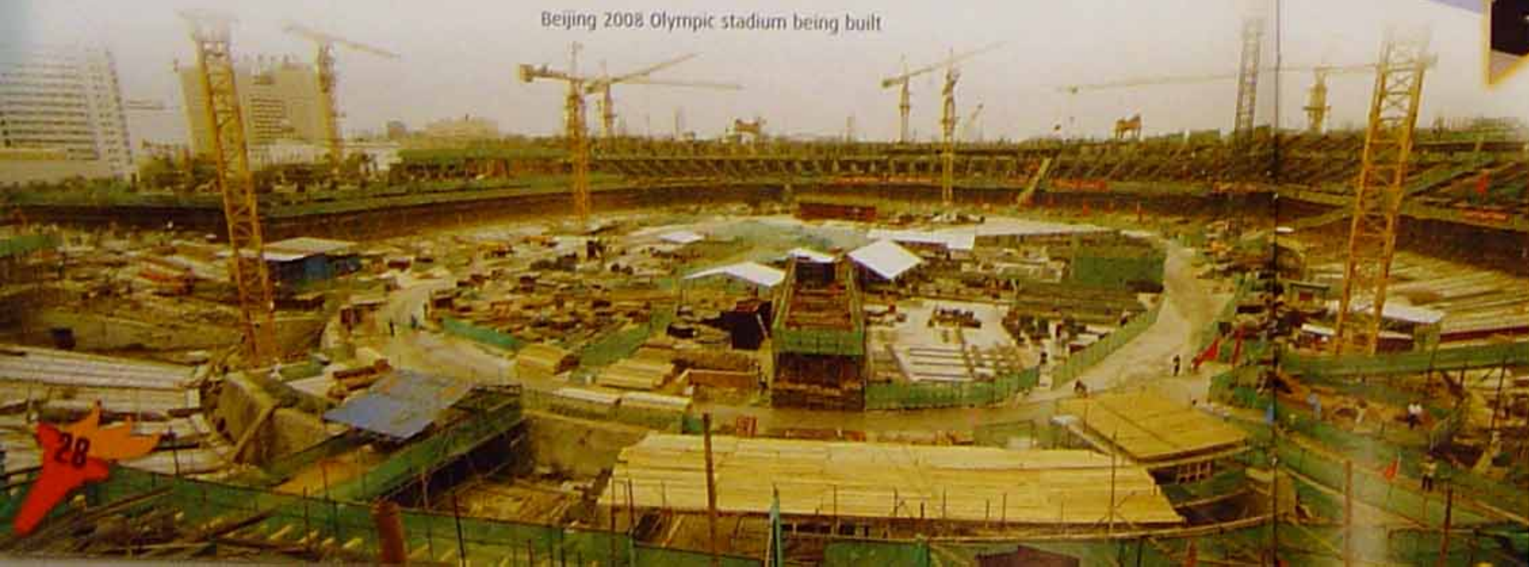
Beijing 2008 Olympic stadium being built

And on the food front, according to a report in the UK's The Times newspaper, Chinese Olympic officials aren't leaving anything to chance. Food destined for athletes' plates , including milk, salad and seasonings, is to be tested 24 hours before, on white mice.