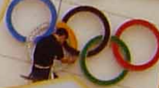
The Olympic rings for Beijing 2008 being completed