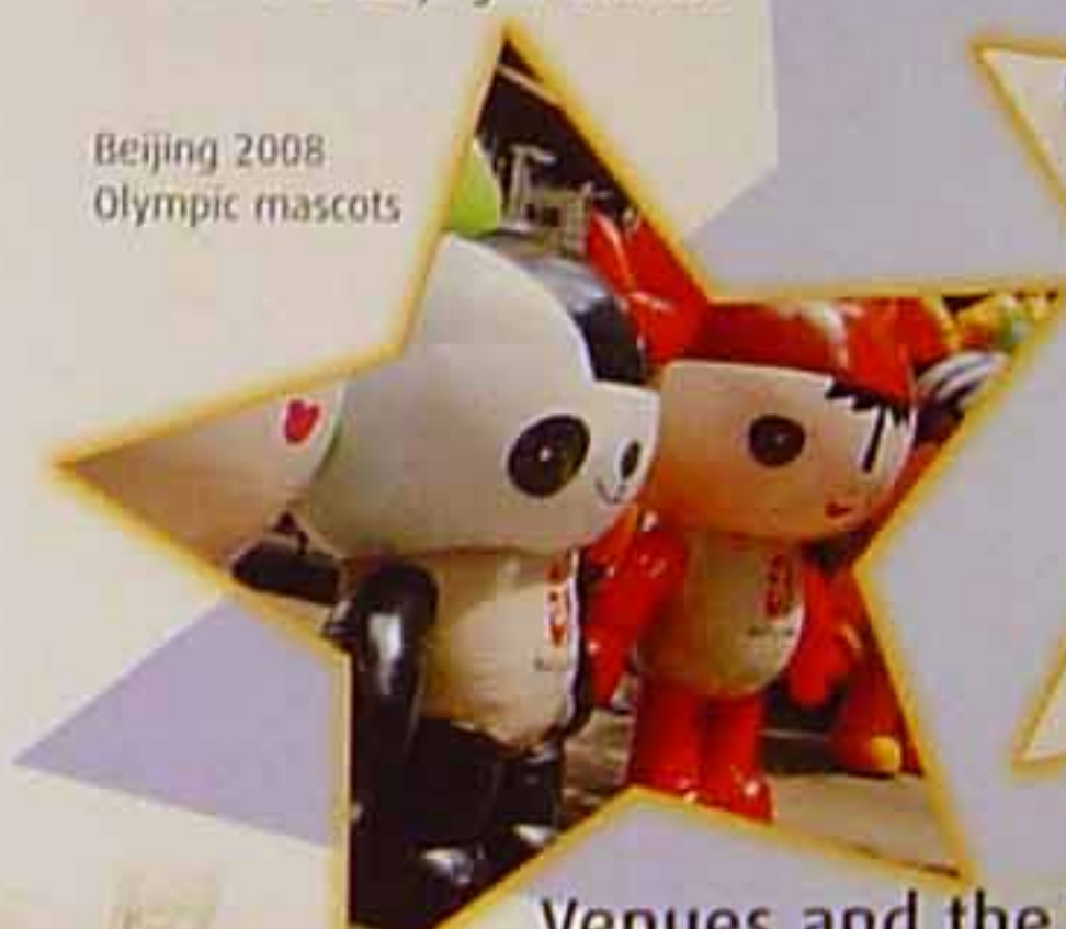
Beijing 2008 Olympic mascots

The Beijing games will have five mascots known as fuwa . Four signify popular Chinese creatures – fish, panda, swallow and Tibetan antelope. The fifth symbolises the Olympic flame. When their names are said together – Bei Jing Huan Ying Ni – they say 'Welcome to Beijing' in Chinese.