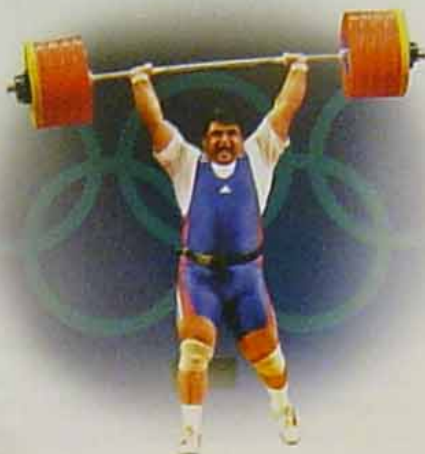
Hossein Rezazadeh from Iran competing at the Sydney Olympics in 2000

At Athens, 2004, heavyweight weightlifter Hossein Rezazadeh broke the world record by lifting a staggering 263.5kg on his way to his second gold medal in a row.