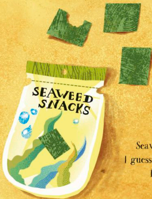
Seaweed crackers. I guess mermaids might like these?