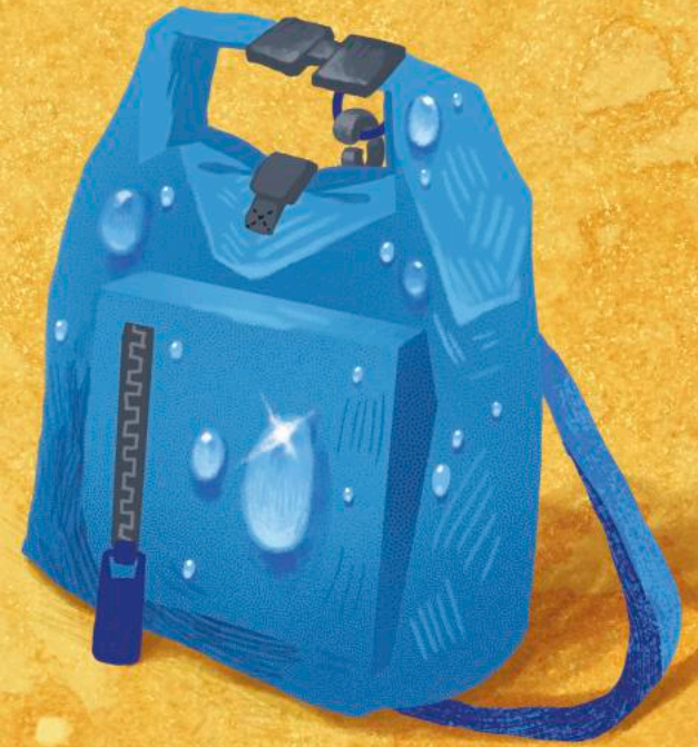
An ocean adventure bag.