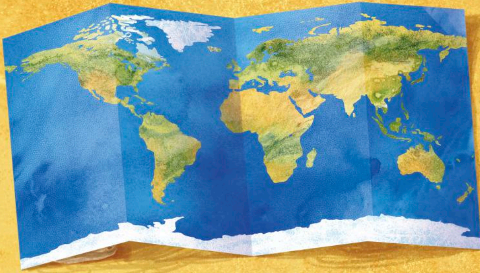
A map of the world— apparently, 71 per cent of our Earth's surface is ocean!