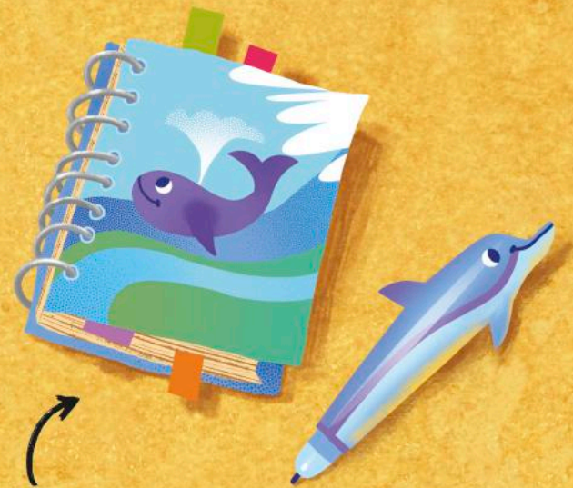
Notebook and dolphin pen— for important observations.

Luckily we have everything we need right here!