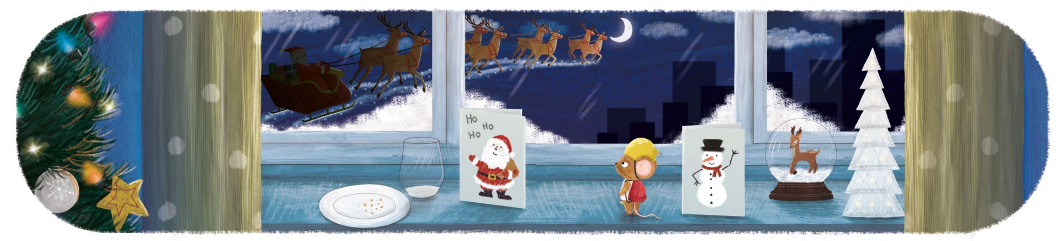
Christmas Tree Mouse begins.