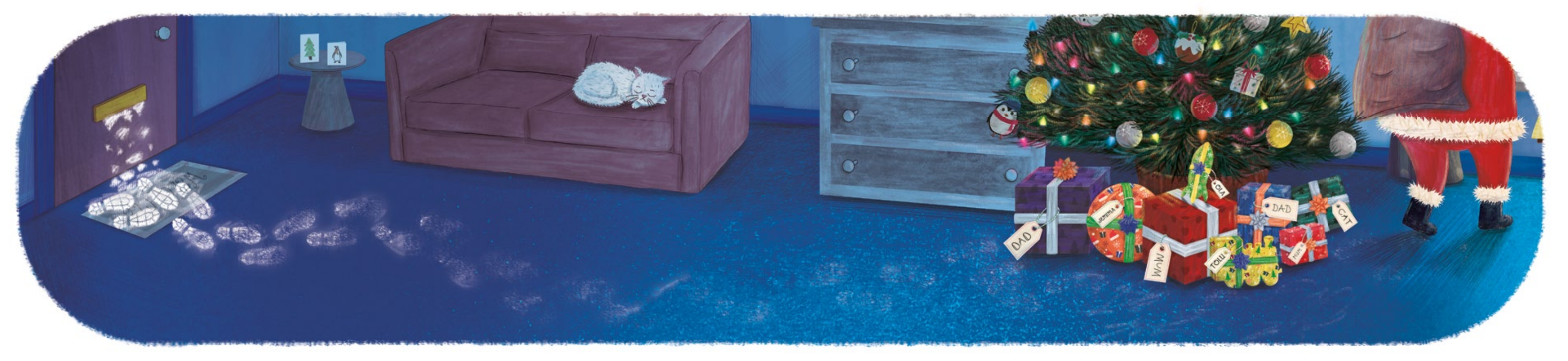
then eaten up the mince pies and flown from the roof or balcony to his next special stop . . .

So, once Santa has squeezed through the letterbox and left the presents under the tree,