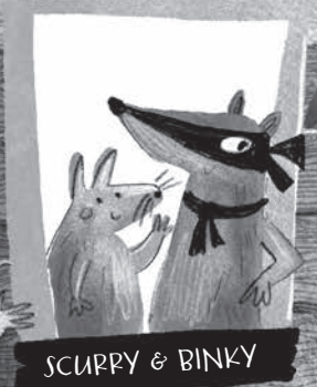
SCURRY & BINKY