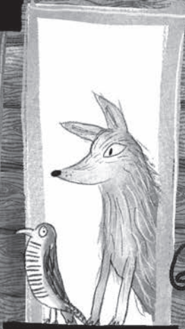
CASPER & FERGUS