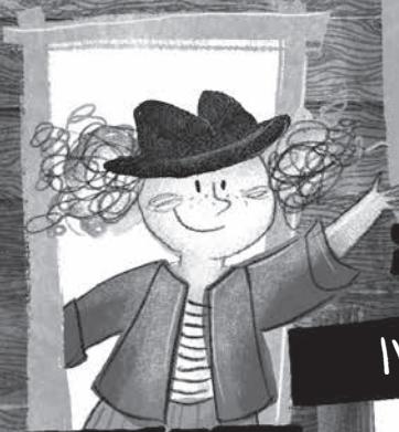
IVY & TOM