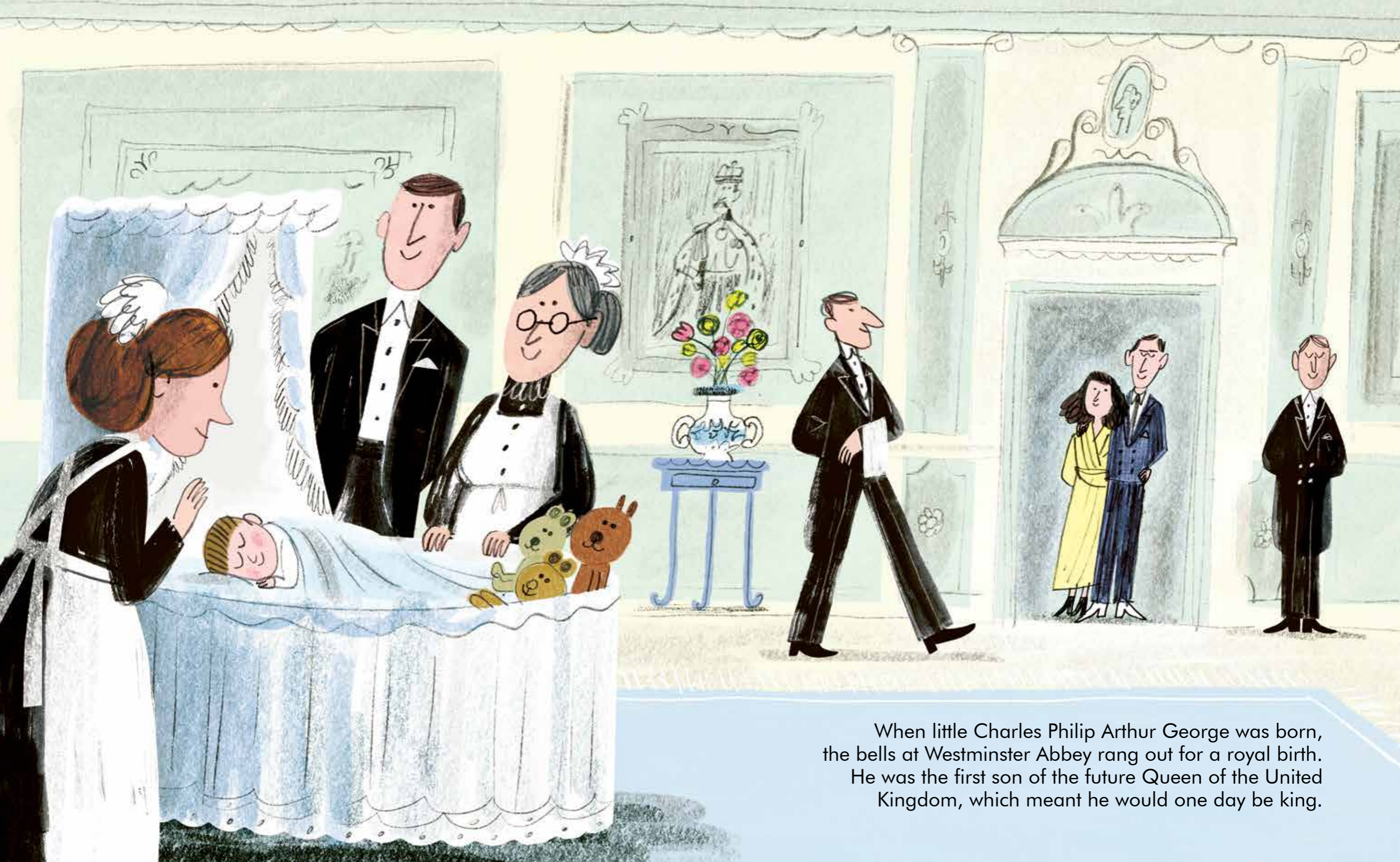
When little Charles Philip Arthur George was born, the bells at Westminster Abbey rang out for a royal birth. He was the first son of the future Queen of the United Kingdom, which meant he would one day be king.