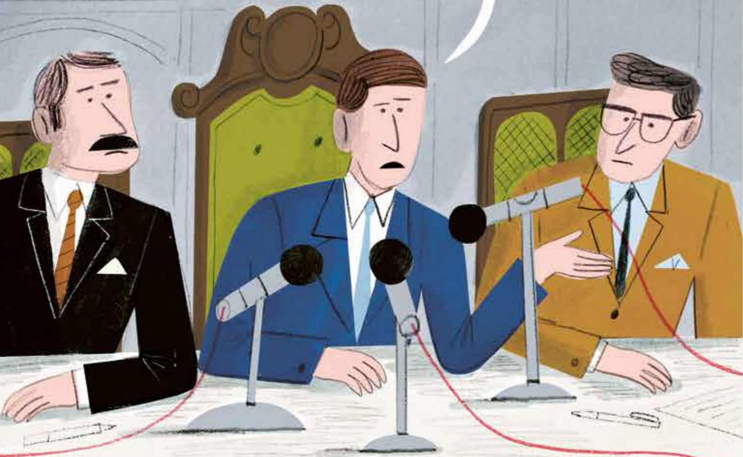
Charles was twenty-one when he gave his first speech defending the environment, long before global warming became a well-known issue.

After completing his duty serving in the Royal Navy, he used his final wages to create a charity that helps young people to fulfil their dreams.