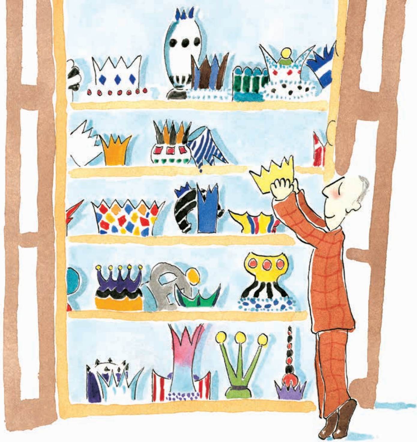
. . . with many crowns