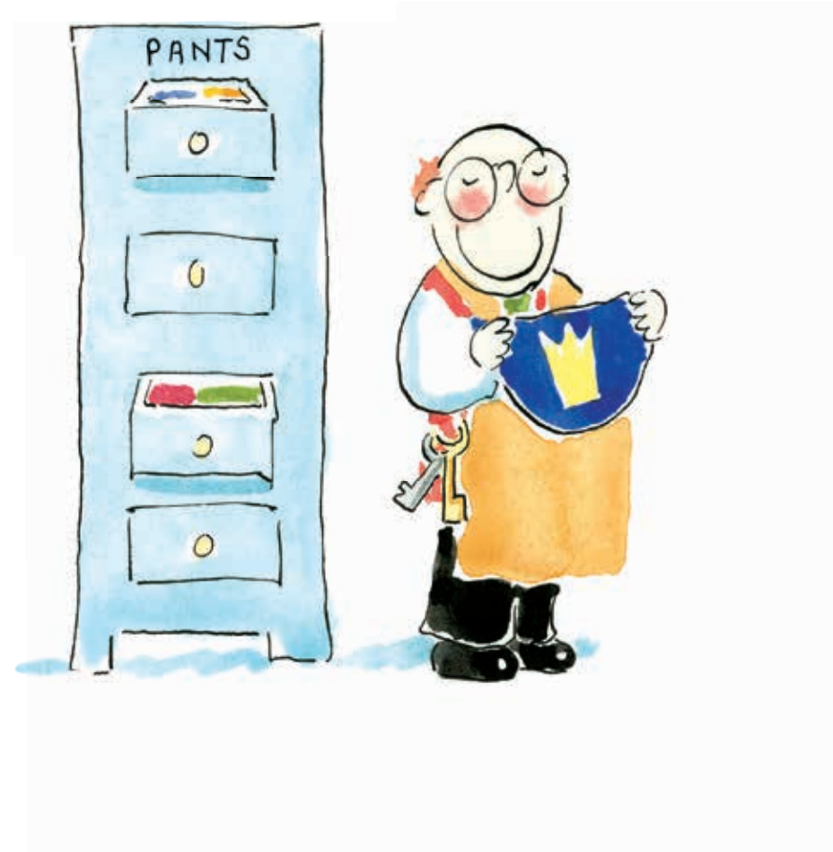
Cedric is the Keeper of the King's Pants – the Everyday Pants, the Weekend Pants . . .

and the Coronation Pants. The King cannot be crowned without these.