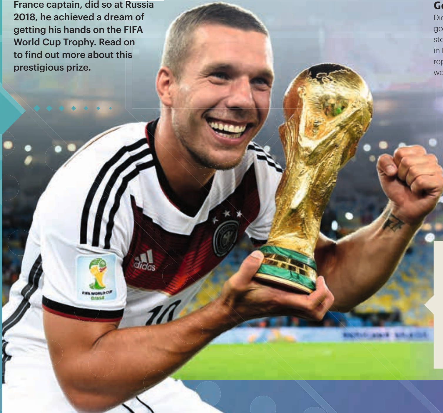
▼ Germany's Lukas Podolski poses with the trophy after the team's victory over Argentina at Brazil 2014.

The golden reward for being crowned FIFA World Cup™ champions is lifting the most coveted trophy in the game. In the competition's 92-year history, just eight nations have had the honour of showing off the glitzy prize. When Hugo Lloris, the France captain, did so at Russia 2018, he achieved a dream of getting his hands on the FIFA World Cup Trophy. Read on to find out more about this prestigious prize.