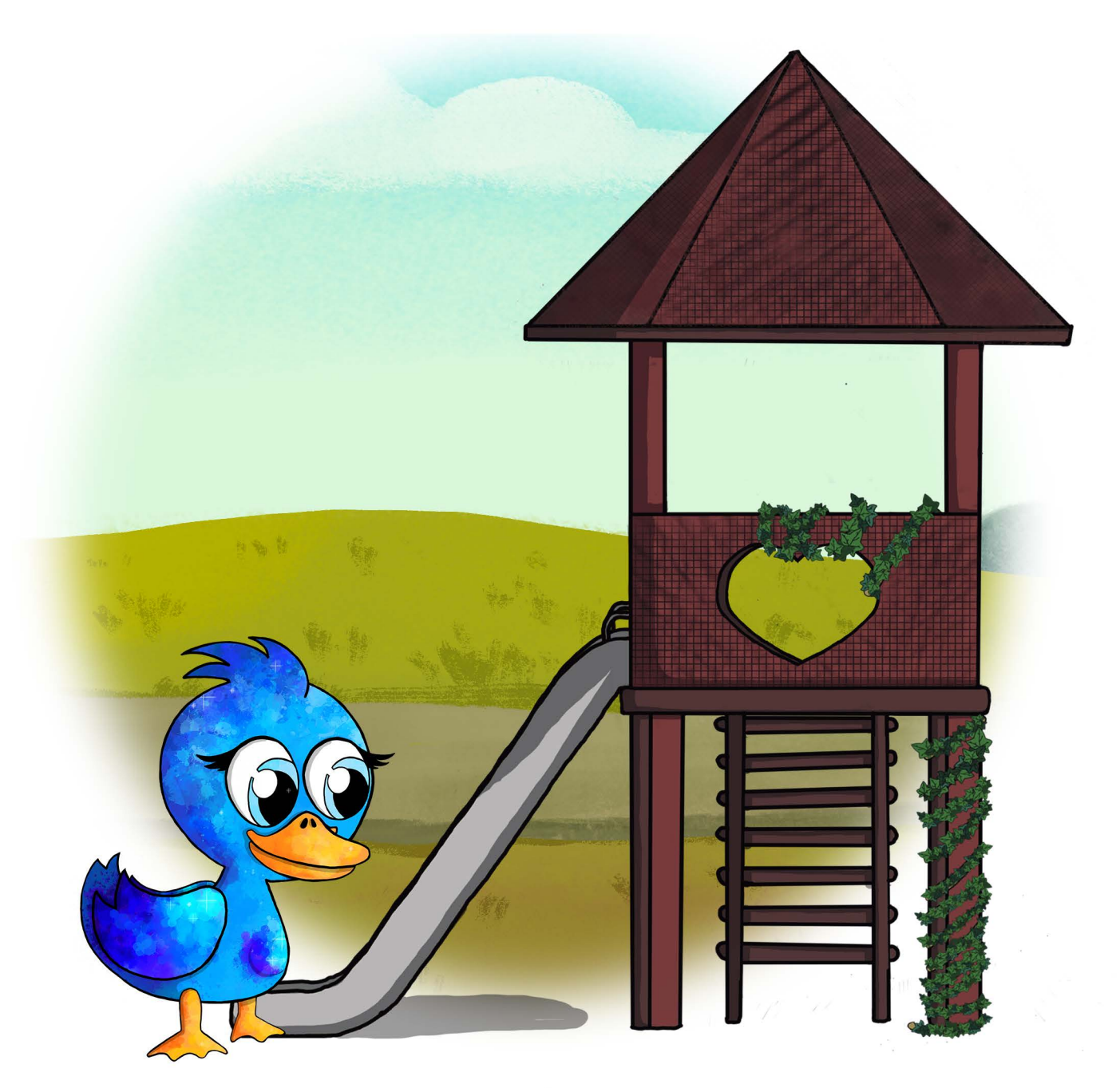
Bella is blue, "Oh goodness me!"