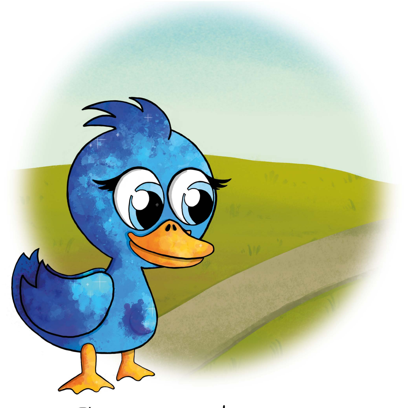
This is Bella, a duck, you can see