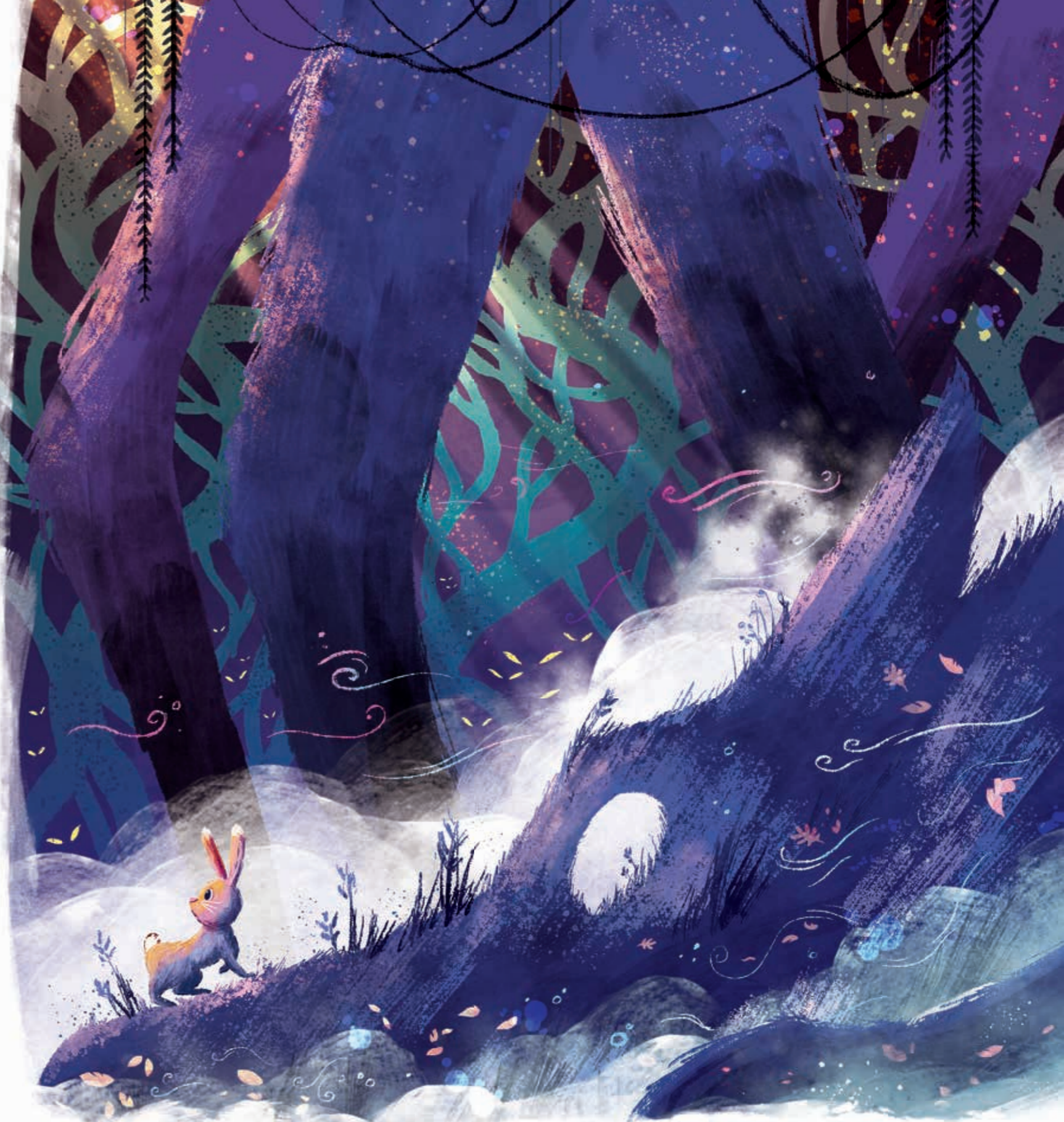
One thousand, hungry-eyed wolves watch her through twisted trees.