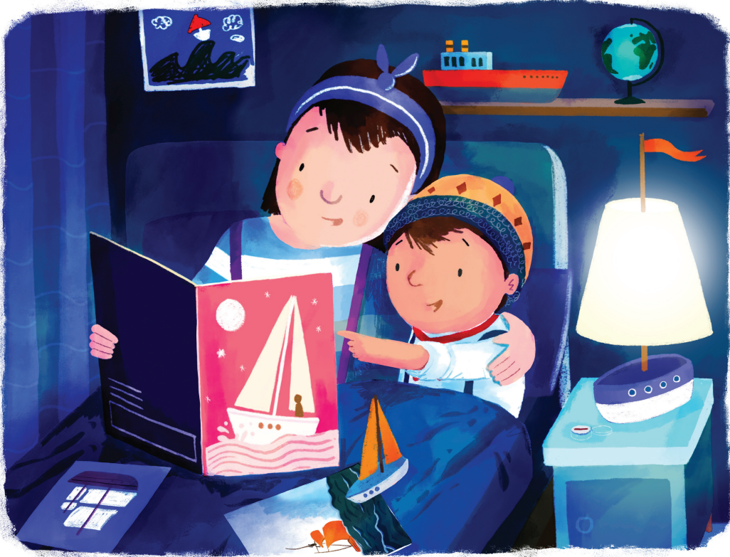
The books he loved best at bedtime told tales of SEA ADVENTURES.