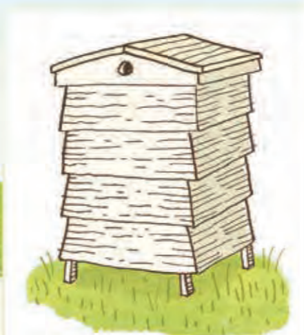
Fig. a. A beehive.

A hive is a house for bees. If you do not have one yet, it is important to stow your bees safely until you have built your hive.