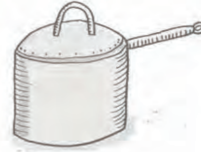
Fig. 2. In a large saucepan.