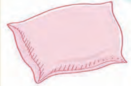
Fig. 3. Underneath your pillow.