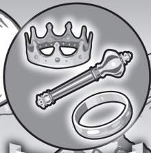
The Three Gifts