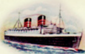
R.M.S. "The Queen Mary"