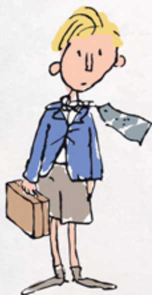
James Henry Trotter, Age 7