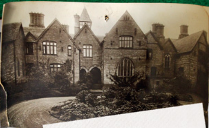
Repton School, which Roald attended from the age of 13