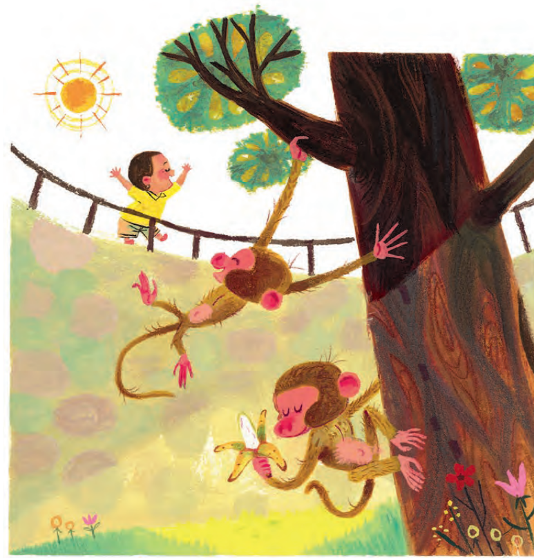
There were monkeys. Louis danced with them ...