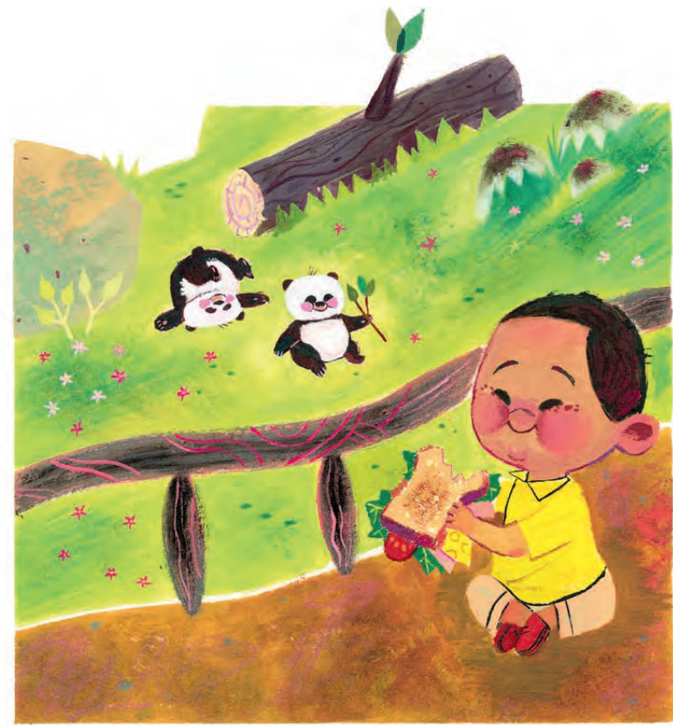
There were pandas. Louis munched with them.