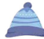
_____ fabric _____

Label each material using the words from the Word Bank.