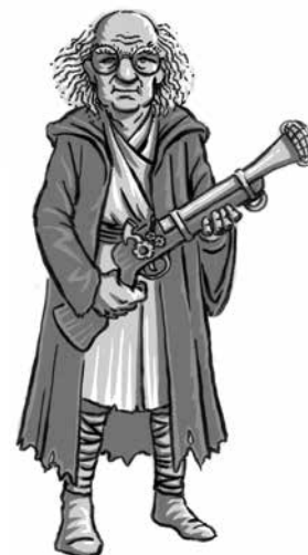
Salterius A kindly, old inventor, now banished from Brecklan.