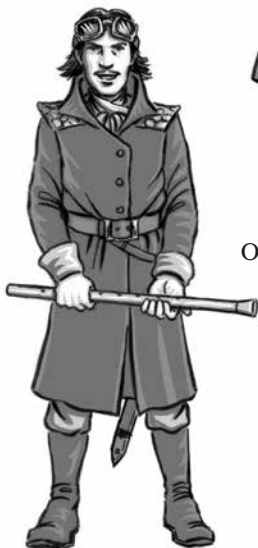
Sir Neville Avingdon Evil master of the Swamp States, with his eye on conquering Brecklan.