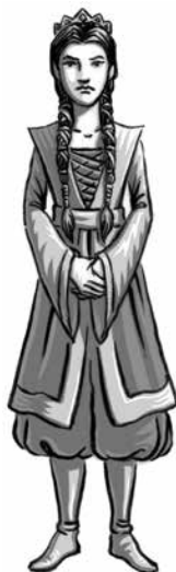
Queen Ignis Mysterious queen of Volcanica, a neutral state in Panterra.