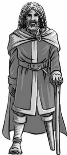
Lord Harding Longtime ruler of Brecklan, and Henry's guardian.