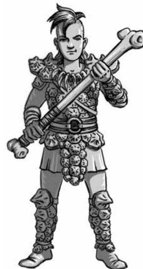
Krilla Chief Guard of the Swamp States, known for her strength and ruthlessness.