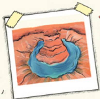
GRAND CANYON (USA) The Colorado River began carving out this canyon millions of years ago. Today in some places it is up to 18 miles across and 1,800 metres deep.

If you can't visit these sights, fear not. You can find other places nearer to you that are so incredible that they need to be protected and preserved. Look on a map for national parks, wilderness areas and UNESCO World Heritage Sites. Visit those and enjoy their awesomeness!