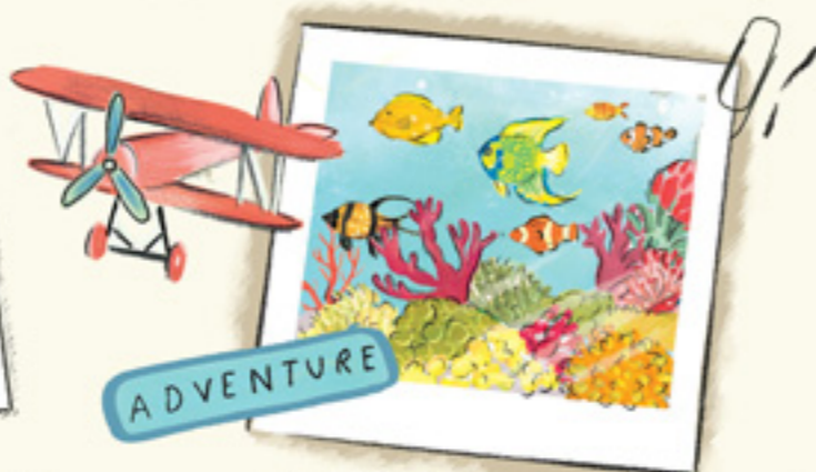
GREAT BARRIER REEF (AUSTRALIA) This 1,400-mile-long coral reef is bursting with all kinds of marine life.