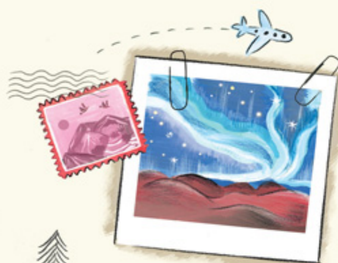
NORTHERN LIGHTS (ARCTIC CIRCLE) Watch as cosmic space particles collide with the Earth's atmosphere and create a magical light show in the sky.