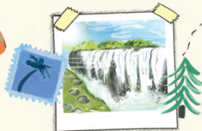
VICTORIA FALLS (ZAMBIA AND ZIMBABWE) Watch the waters of the Zambezi River plunge 108 metres in the world's most spectacular waterfall.