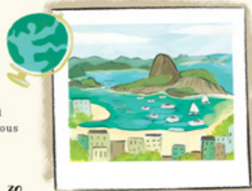
GUANABARA BAY (BRAZIL) The deepest natural bay in the world has 130 pointy islands, the most famous being Sugarloaf Mountain.