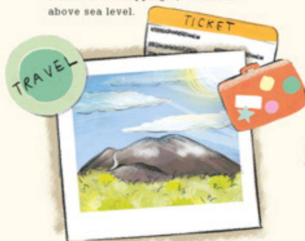
PARÍCUTIN (MEXICO) A 200-metre-wide cinder cone volcano which, over the course of a nine-year eruption, spewed molten lava onto the landscape around it.