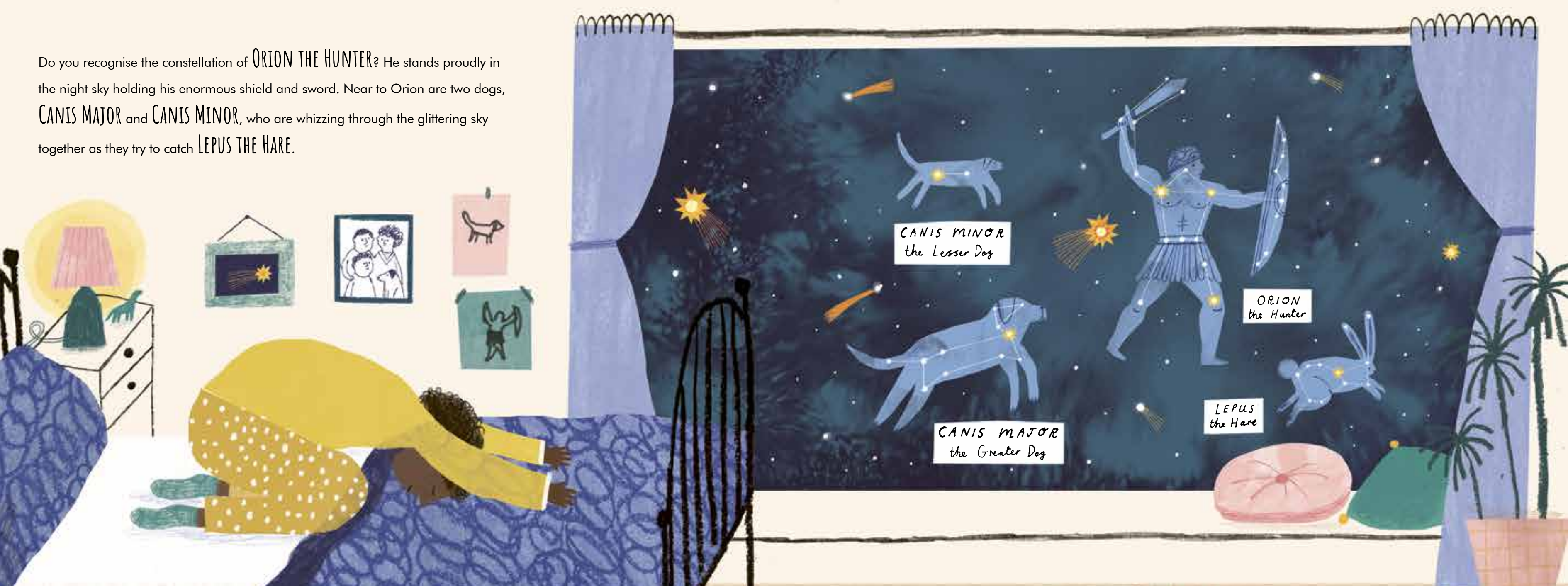
CANIS MINOR the Lesser Dog

Do you recognise the constellation of ORION THE HUNTER ? He stands proudly in the night sky holding his enormous shield and sword. Near to Orion are two dogs, CANIS MAJOR and CANIS MINOR , who are whizzing through the glittering sky together as they try to catch LEPUS THE HARE .