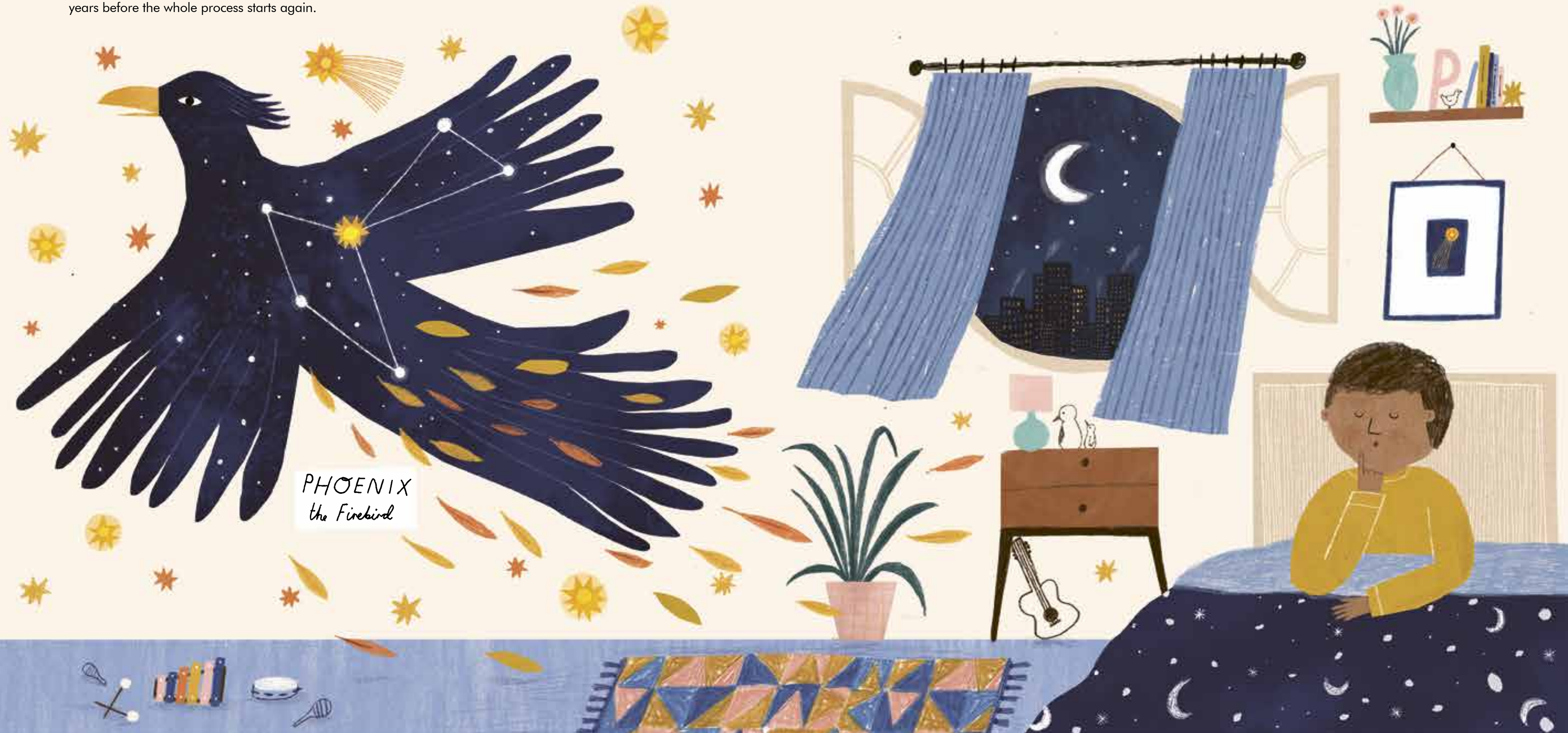
PHOENIX the Firebird

Can you imagine a beautiful red phoenix feather? Close your eyes and picture it as clearly as you can. Now hold up one finger in front of your mouth and pretend it is the feather. Take a deep breath in through your nose. As you breathe out, blow the air out through your mouth very slowly and softly. Feel the air on your finger and imagine the feather fluttering as you blow on it. Breathe in slowly through your nose and repeat three times.