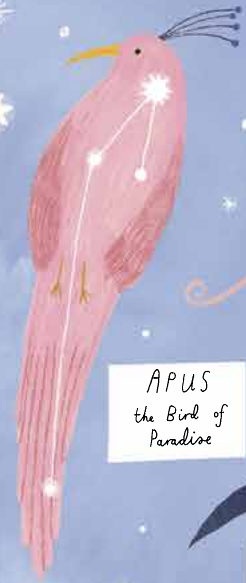
APUS the Bird of Paradise