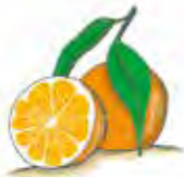
The citrus fruits 25