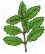
The herbs 71