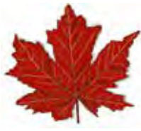
The giants 56