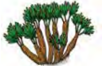
The rock plants 133