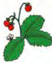
The forest dwellers 44