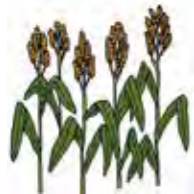
The cereals 22