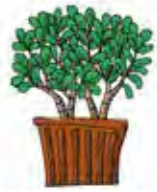
The air fresheners 5