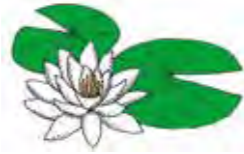
The aquatics 11