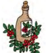
The healers 65