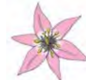
The stars 158