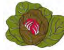
The salads 138