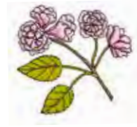
The ornamentals 108