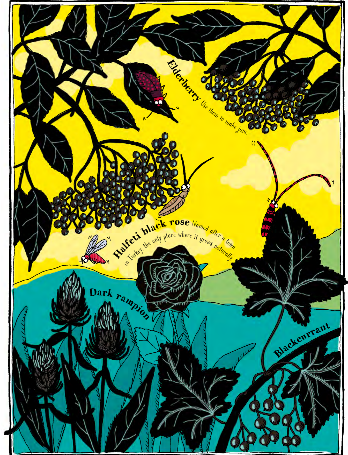
Elderberry Use them to make jam.