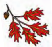
The deciduous trees 34