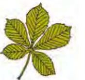
Appendix: Leaf Shapes 210

PLANTOPEDIA celebrates the dazzling and diverse plants that grow on Planet Earth. Without plants, people wouldn't exist - they provide us with food, and the materials we need to make things like plastic, clothes and houses. They even clean the air, giving us the oxygen we need to breathe. But sadly many plants are now under threat from things like farming, road-building, pollution and climate change.