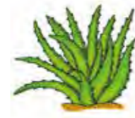
The sand lovers 141