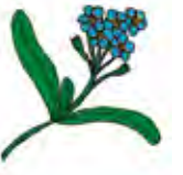
The perennials 113