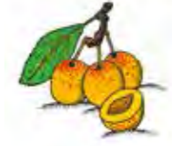
The stoned fruits 164