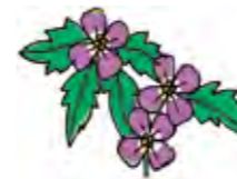
The spreaders 155