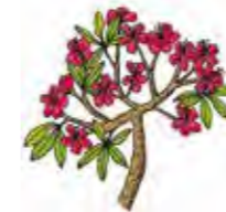
The tropical 171