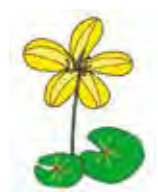
The whites and yellows 179