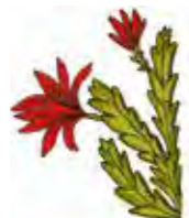
The guests 61