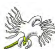
The lookalikes 90