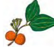
The poisonous 120