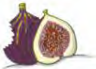
The tasty fruits 166