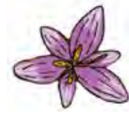
The spices 149