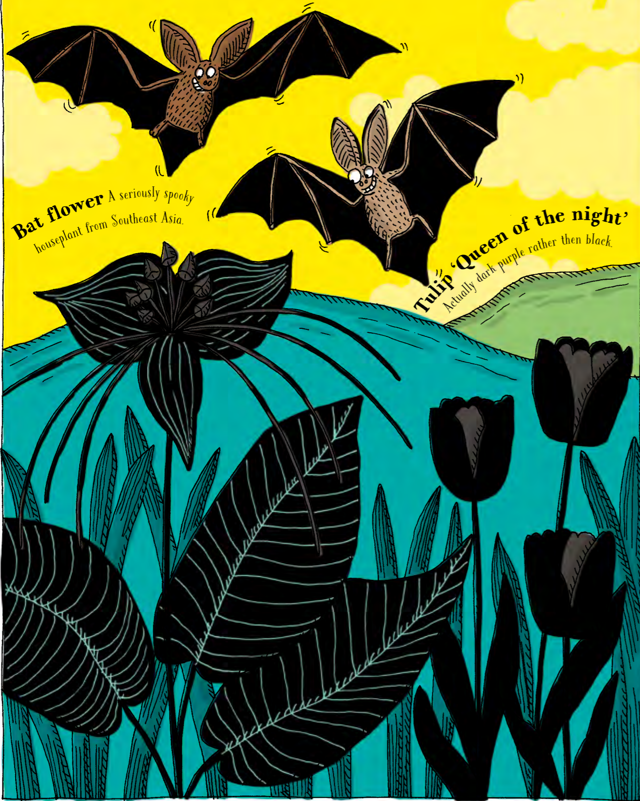
Bat flower A seriously spooky houseplant from Southeast Asia.