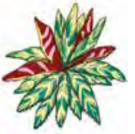
The spotty and stripy 152