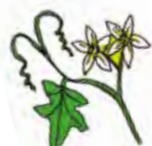
The climbers 28