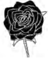
The all-blacks 8