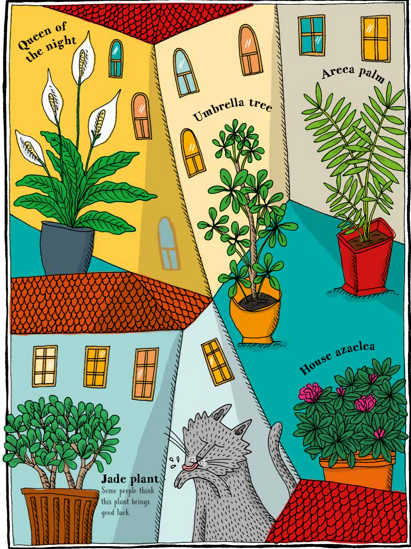
Queen of the night