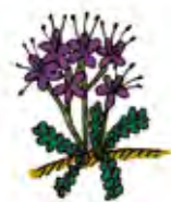
The homebodies 79