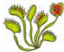
The big eaters 16