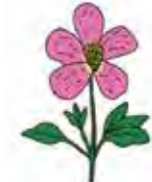
The reds and pinks 129