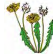
The seed sowers 146