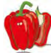
The confused fruits 31