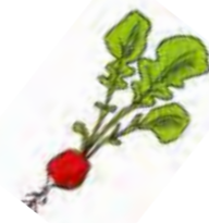
The garden vegetables 50