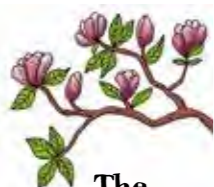
The hybrids 83