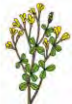
The dyes 38