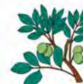
The useful 175