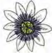
The blues and purples 19