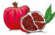
The fruits you have to peel 45