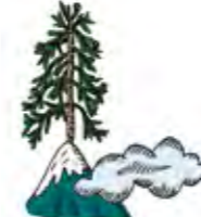
The mountaineers 101