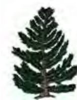
The old timers 104