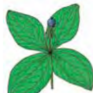
The imposters 86