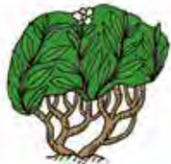
The evergreens 41