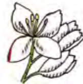
The perfumed 116