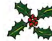
The prickly 124