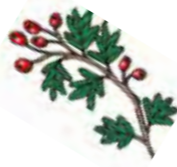
The historical 75