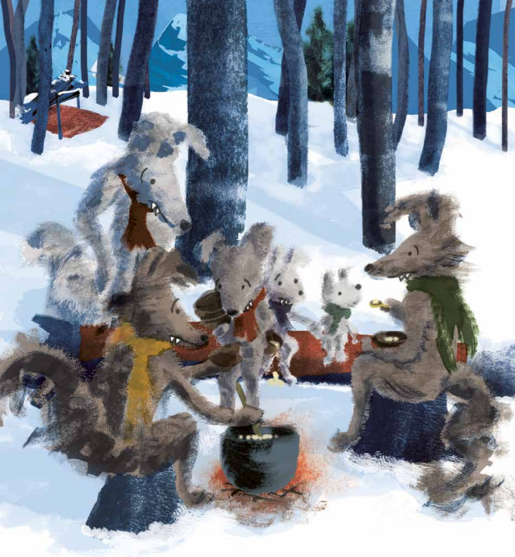
The wolf pack did everything together...

which could be a bit frustrating for a young cub.