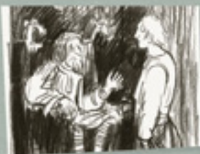
Beowulf comes to help a Danish king, whose men are being attacked by a man-eating monster known as Grendel.

Then there are stories about some of the earliest super-heroes, like the Swedish warrior, BEOWULF – a hero so strong he tore off a man-eating monster's arm in single combat!