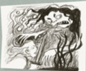
Grendel's mother is even fiercer! But Beowulf tracks her to the bottom of a lake and kills her with a sword.