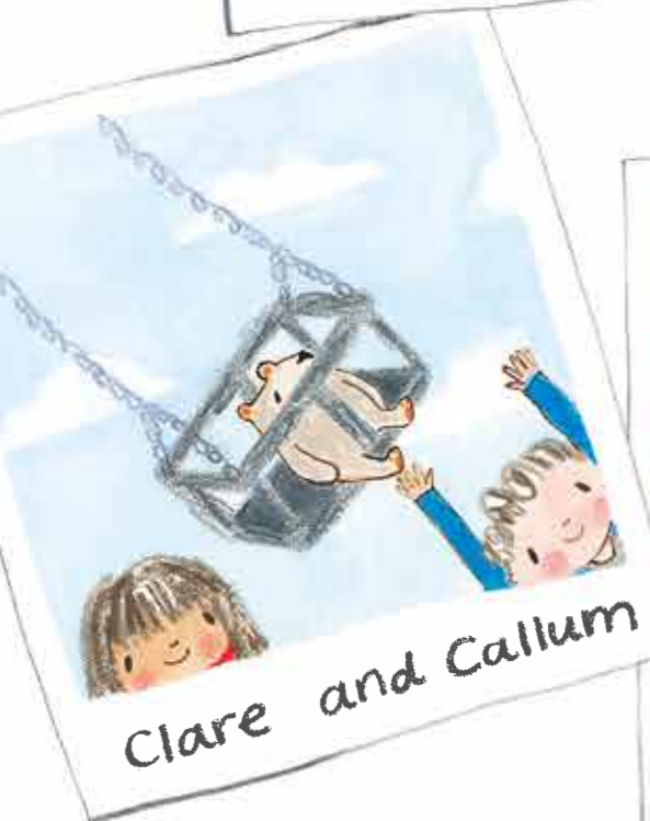
Clare and Callum