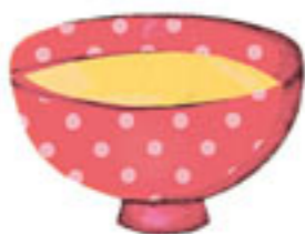
碗 wǎn bowl