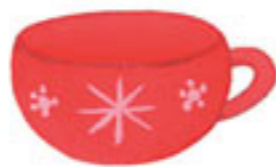
杯子 bēi zi cup