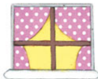
窗户 chuāng hu window