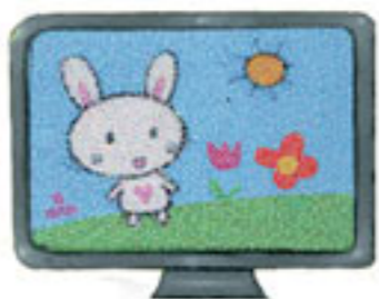
电视 diàn shì television