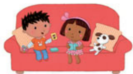
沙发 shā fā sofa