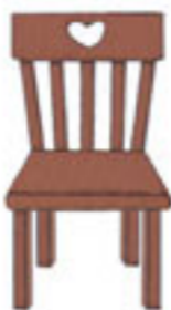
椅子 yǐ zi chair