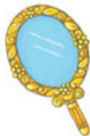
镜子 jìng zi mirror