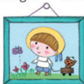
图片 tú piàn picture