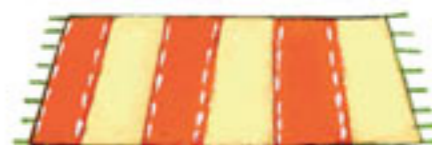
地毯 dì tǎn rug