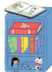
书柜 shū guì bookcase