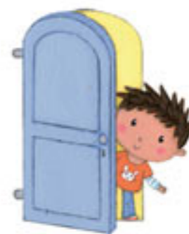
门 mén door