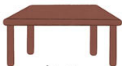
桌子 zhuō zi table