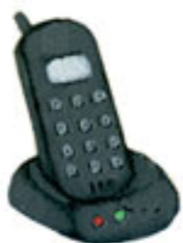
电话 diàn huà telephone