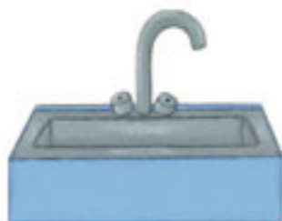
水池 shuǐ chí sink