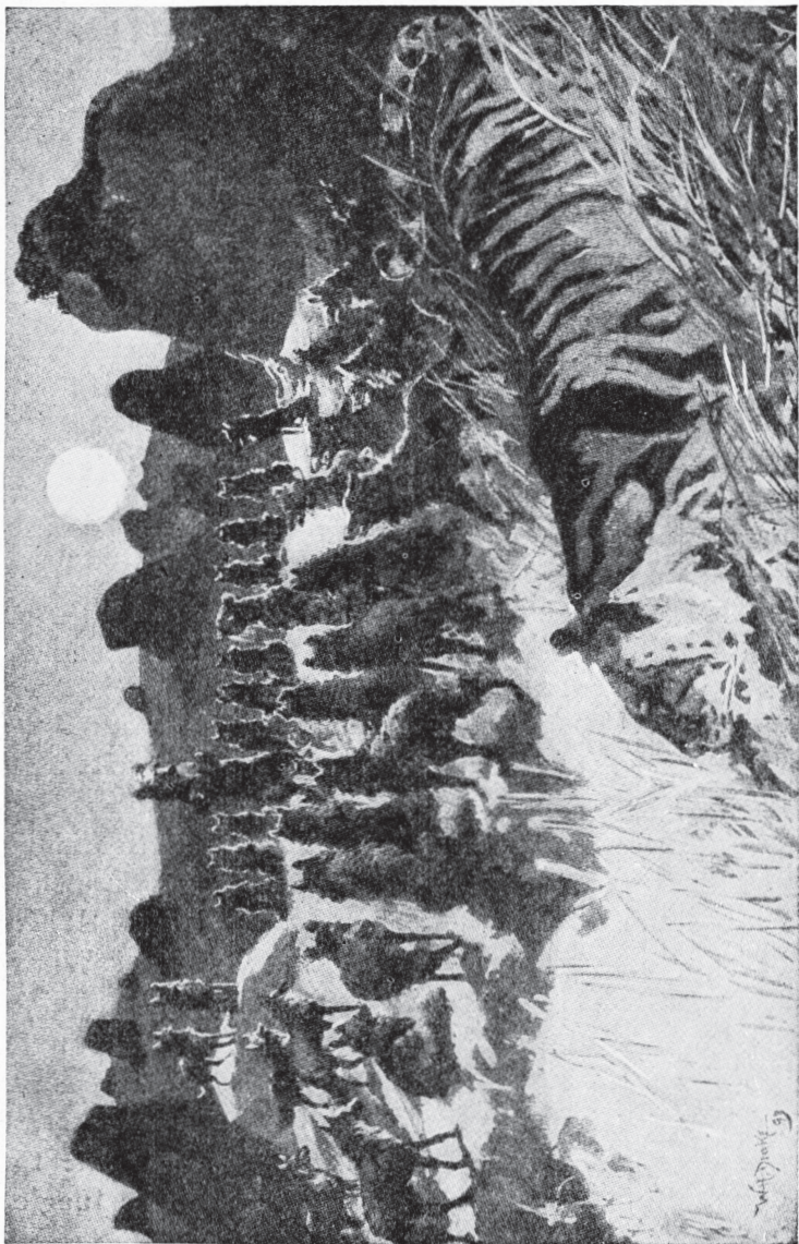
THE MEETING AT THE COUNCIL ROCK.