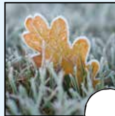
A frosty leaf