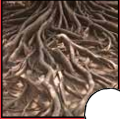
Wiggly tree roots