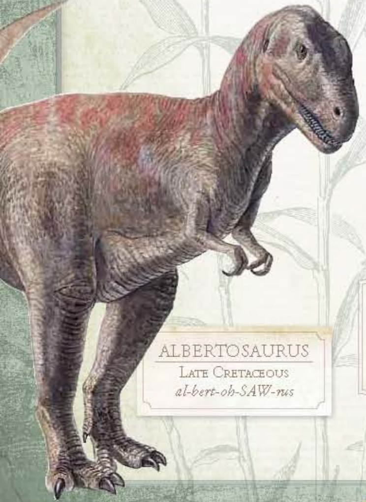
ALBERTOSAURUS LATE CRETACEOUS al-ber-oh-SAW-rus

Which of these ferocious reptiles has a venomous bite?