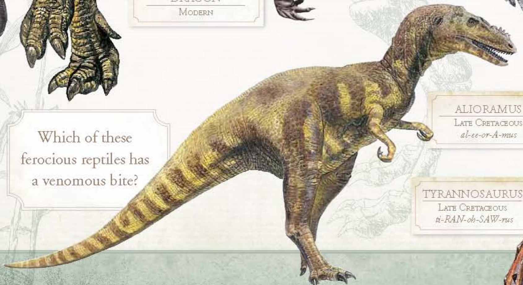
TYRANNOSAURUS LATE CRETACEOUS ti-RAN-oh-SAW-rus