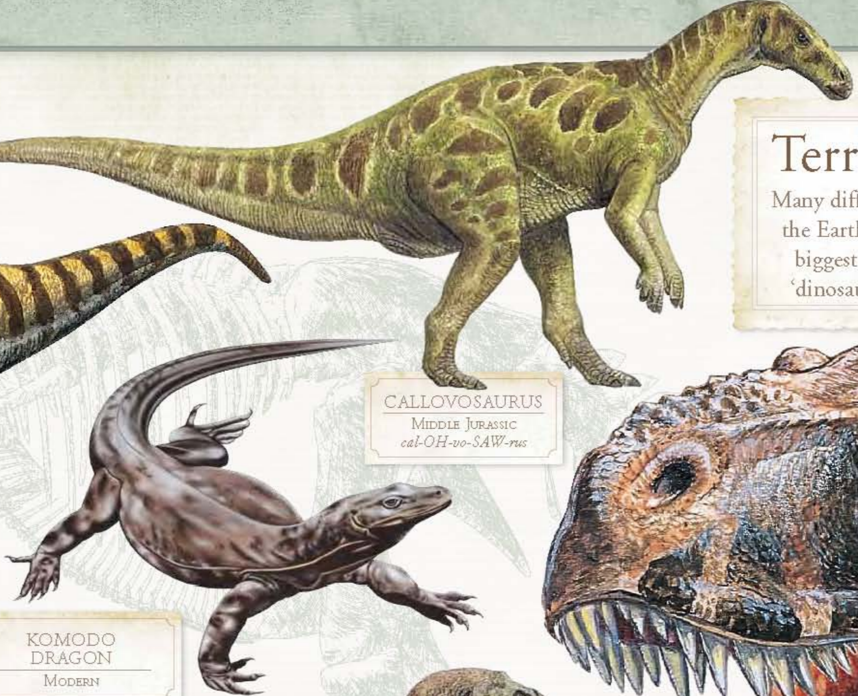
KOMODO DRAGON MODERN