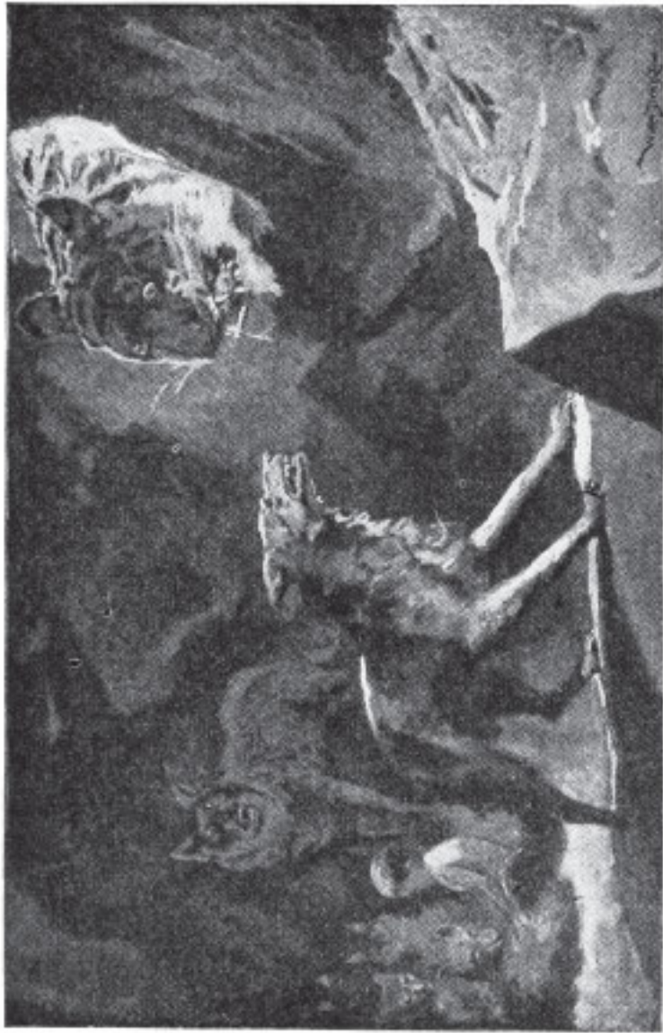
THE TIGER'S ROAR FILLED THE AIR WITH THUNDER.