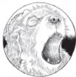
NANNY DARLING TAUGHT ADA TO BARK LOUDLY