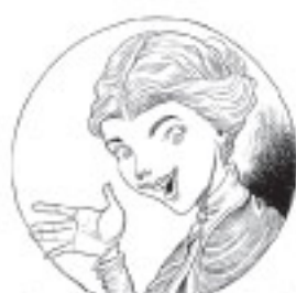
HERE POPPINS TAUGHT ADA TO SING TONGUE-TWISTING SONGS